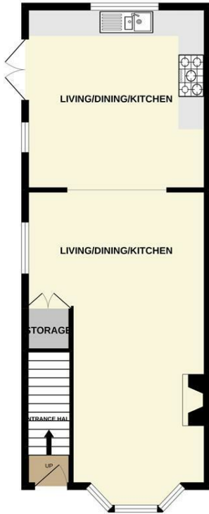
GROUND FLOOR 526 sq.ft. (48.9 sq.m.) approx.